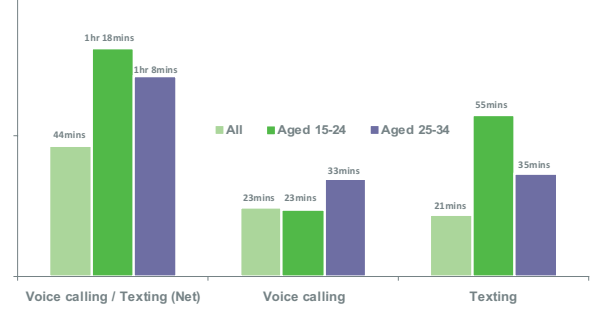
Figure 1. Time spent using a mobile phone, on an average day